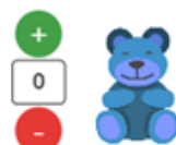
Add or delete objects from the Pictogram