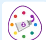
Paint a Picture