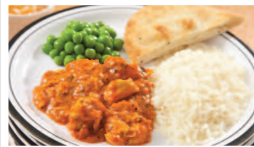
Chicken Tikka Masala served with Rice, Naan Bread & Seasonal Vegetables