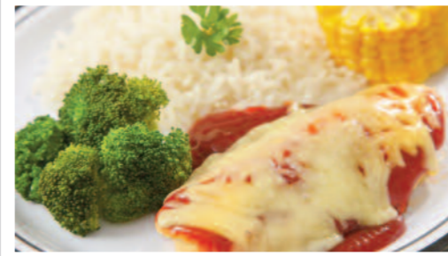
BBQ Chicken served with Savoury Rice and Seasonal Vegetables