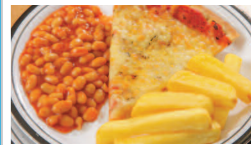
Cheese & Tomato Pizza served with Chips & Peas or Baked Beans

VEGETARIAN VERSIONS OF THE ABOVE MEAL AVAILABLE DAILY