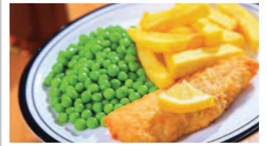
Battered Fish (MSC) served with Chips & Peas or Baked Beans