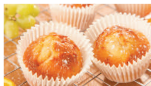
Apple & Cinnamon Muffin