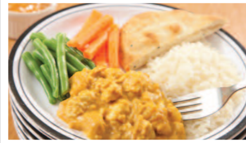
Chicken Korma served with Rice, Naan Bread & Seasonal Vegetables