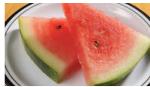
Fresh Water Melon Wedge