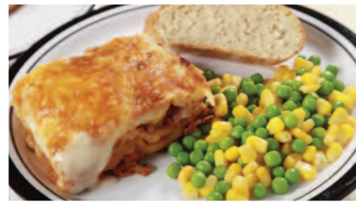
Beef Lasagne served with Garlic & Herb Bread and Seasonal Vegetables