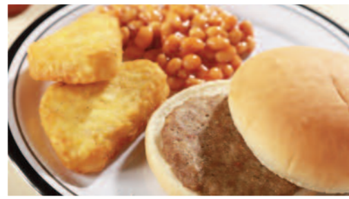
Sausage Pattie in a Bun, Hash Browns and Baked Beans