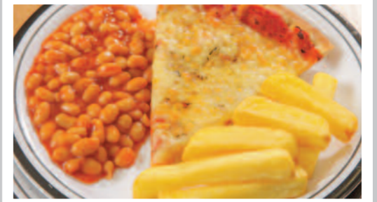
Cheese & Tomato Pizza served with Chips & Peas or Baked Beans