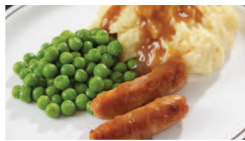
Sausages served with Mashed Potato, Seasonal Vegetables & Gravy