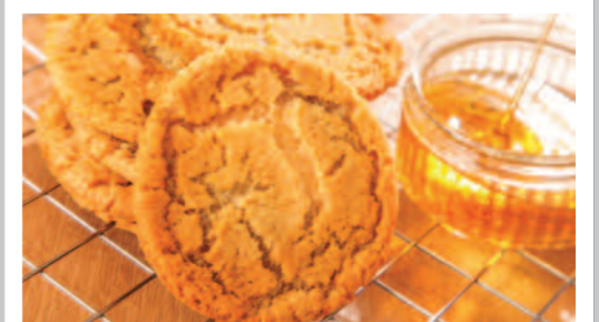
Golden Crunch Cookie

AVAILABLE EVERY DAY – UNLIMITED SALAD, FRESHLY BAKED BREAD, FRUIT YOGHURT & FRESH FRUIT PLATTER. FOR ALLERGEN INFORMATION, PLEASE ASK ONE OF OUR CATERING TEAM. ALL THE ABOVE DISHES ARE SUBJECT TO AVAILABILITY.