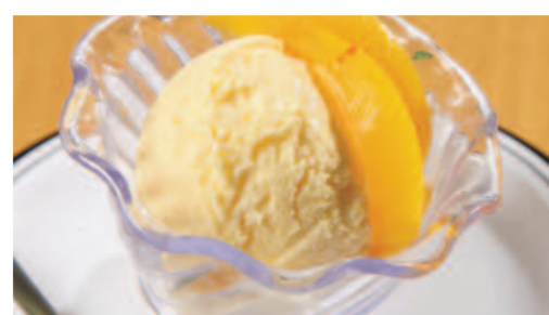
Ice Cream & Fruit