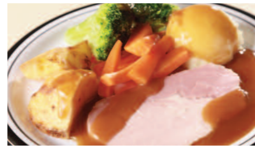
Honey Roast Gammon served with Roast/Mashed Potatoes, Seasonal Vegetables & Gravy