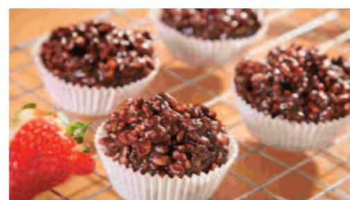
Chocolate Crispy Cake