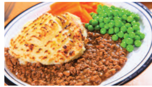
Cottage Pie served with Seasonal Vegetables