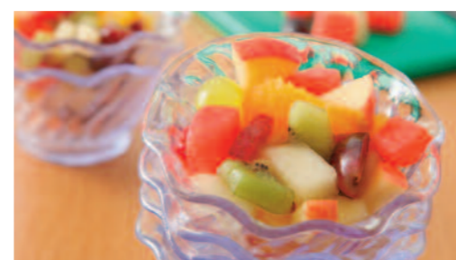
Fresh Fruit Salad