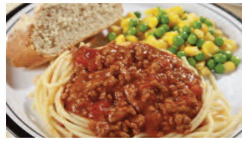
Spaghetti Bolognese served with Garlic & Herb Bread and Seasonal Vegetables