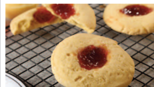
Jam & Custard Biscuit