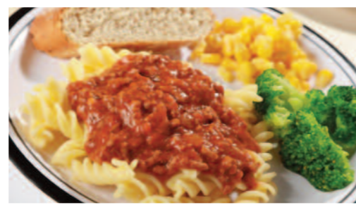
Pasta Bolognese served with Garlic & Herb Bread and Seasonal Vegetables